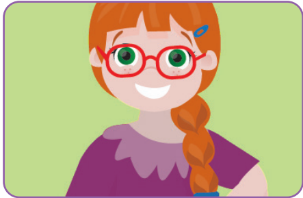
1. She wears .....

freckles – glasses – beard – short – curly – moustache