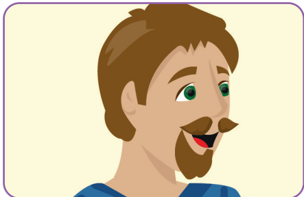
4. He has a moustache and a .....