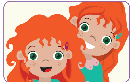
6. They have wavy hair and .....

2. Read the sentences and decide if they refer to picture "A" or "B".