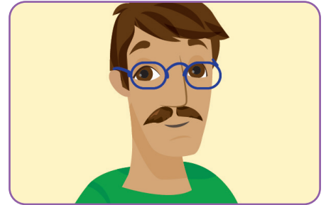
3. He has straight hair and a .....