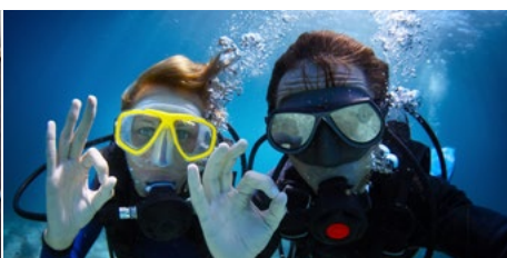
b. last week