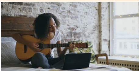
b. for three years