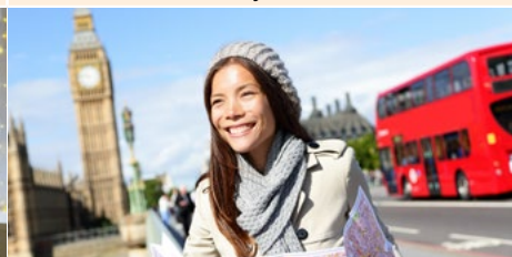
c. in 2019